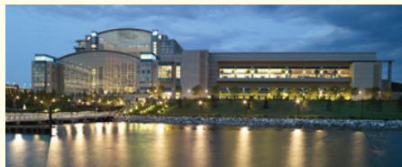
Gaylord National Resort & Convention Center